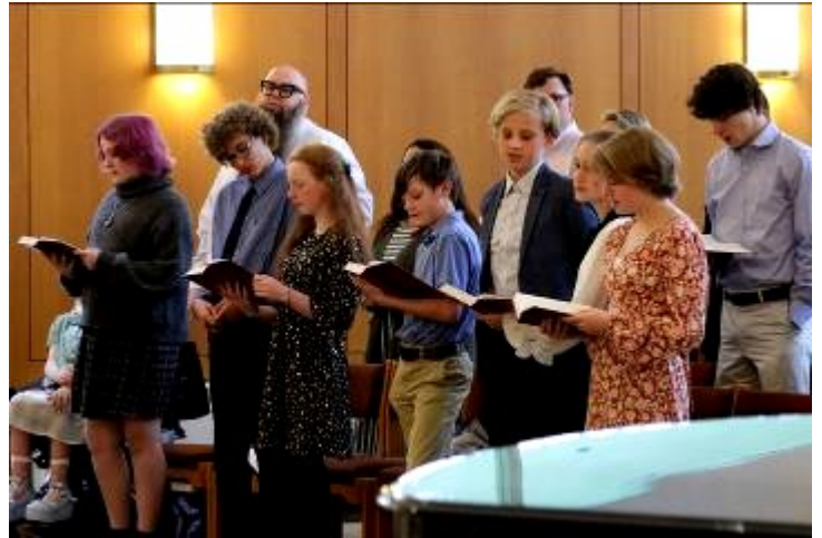
Youth Sunday Sunday, April 30