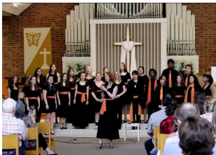
Sunday, April 16 Second Sunday South of the James Concert Featuring: Monacan choir