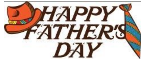
Sunday, June 18